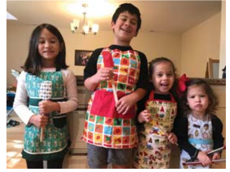
Sherwood siblings in cooking gear!